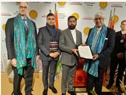
With Mr. Eknath Shinde CM, Maharashtra

The delegation also met with governments of Karnataka, and Tamil Nadu. Each government expressed a proactive willingness to assist Chamber members in their business endeavours.