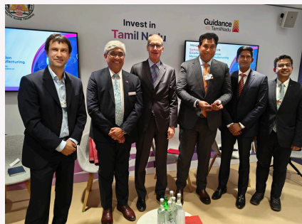
With Dr. T. R. B. Rajaa Hon'ble Minister for Industries, Government of Tamil Nadu